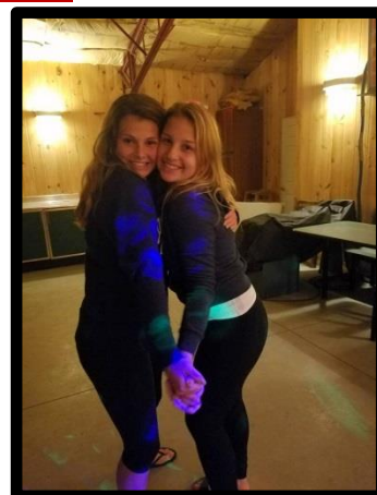
Campers make the Best Friends!