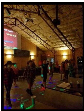
Country Line Dancing!!